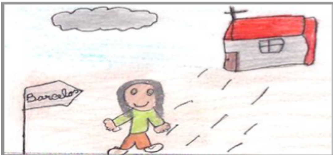
A picture showing the Pilgrim leaving Barcelos (Braga).